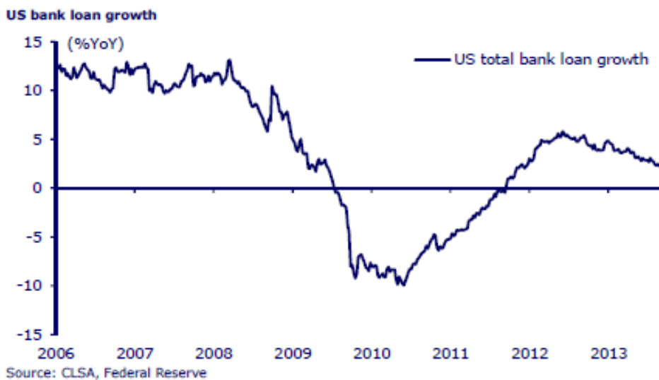
Figure 1 Fading Fuel?